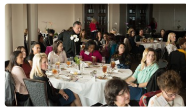
EWL officer and guests with Verizon tables