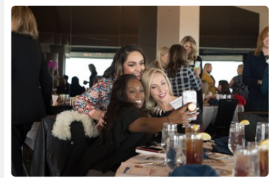
Guests sharing the event on social media!