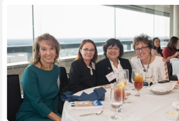
EWL Officer and guests at Whitley Penn table