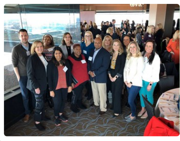
Elevate Credit coworkers and guests