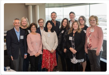
Sabre alum gather for a picture